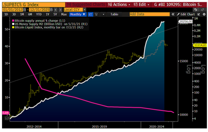
Bitcoin - Potential Savior vs. Unlimited Fiat

Adding Bitcoin to typical store-of-value assets, including bonds and gold, is gaining traction, notably due to the risks of the old-guard metal being replaced by the digital version in investment portfolios.